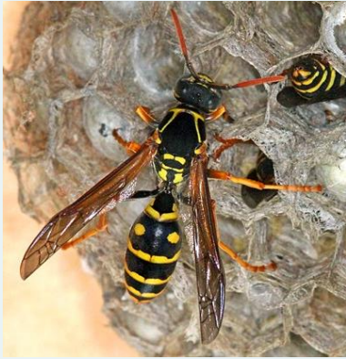
Asian paper wasp